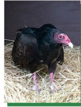
Tomasina (Turkey Vulture)