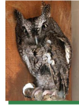
Mountain (Eastern Screech Owl)