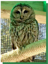
Aya (Barred Owl)