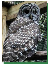
Odin (Barred Owl)