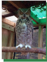
Codi (Great Horned Owl)