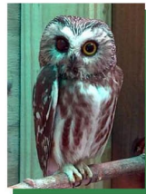
Nutmeg (Northern Saw-whet Owl)