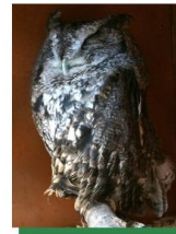
Luna (Eastern Screech Owl)